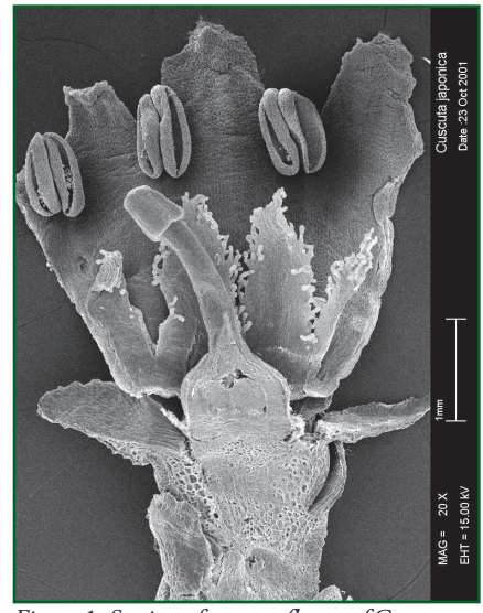
Figure 1. Section of mature flower of C. japonica from central Texas. The fused styles are not evident in this section. The fimbriate infrastaminal scales are prominent.

Readers of Chinquapin will be familiar with our most widely distributed and very conspicuous parasitic plant, field dodder, Cuscuta campestris (sometimes considered to be conspecific with C. pentagona). This species, like all our native dodders in the South is in the section Grammica of the genus Cuscuta. Species in section Grammica have two separate styles and capitate stigmas and produce stem tips with two types of branches-a coiling branch that will wrap around and penetrate a suitable host, and a searching branch that will continue growing and produce more searching branches. The section Cuscuta, which includes several introduced weedy species, have linear stigmas and often very fine stems lacking searching branches. The third section, Monogyna, has no native North American species, has fused styles and is characterized by especially thick stems (Figs. 1, 2). Molecular work has elucidated relationships in the genus but is not presented here; traditional sections are used for this discussion.