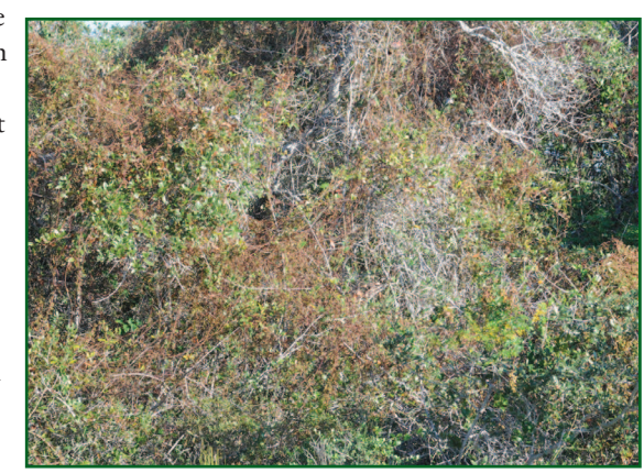
Figure 3. Japanese dodder seriously damaging live oak in Aran sas National Wildlife Refuge.